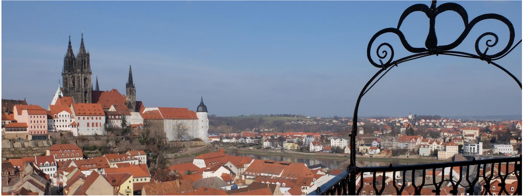
Meissen's impressive castle hill with the palace and the cathedral