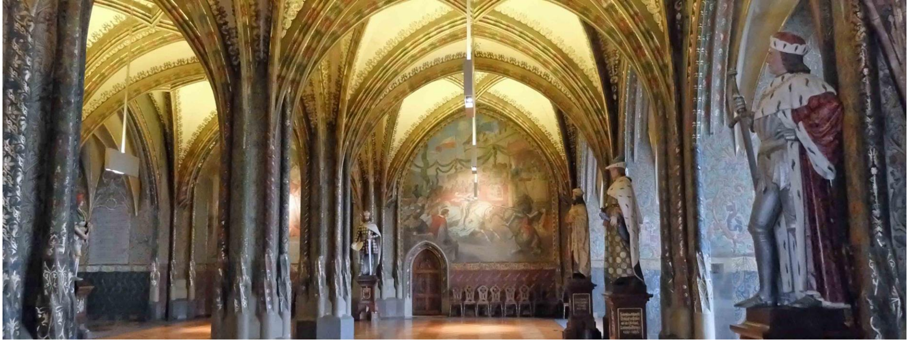
Germany's oldest palace