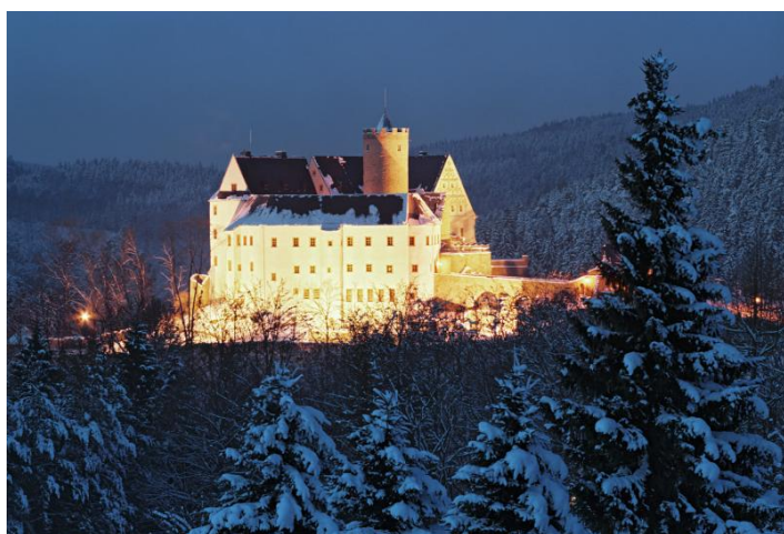
Scharfenstein Castle in a winter's night

OFFER can be booked from October to March (except on Mondays). Rate from EUR 17.00 p.p. for groups of 20 people or more, duration approx. 4 hrs. Alternatively: Guided castle tour. A visit to the World of Wendt & Kuehn can be booked from January to November. Booking required. Touristic infrastructure: Limited accessibility for people with disabilities. Catering at the castle inn on the castle premises (»Burgschaenke Scharfenstein«, www.burgschaenke-scharfenstein.de ). Bus parking facilities available at the foot of the castle, ten-minute walk up to the castle. The Erzgebirgsbahn (Ore Mountain Railway) stops immediately at the foot of the castle.