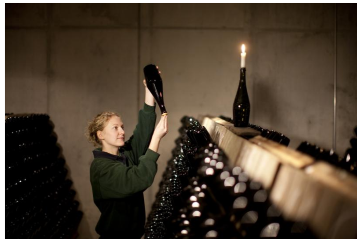
Wackerbarth Castle masterfully maintains the traditional art of bottle fermentation