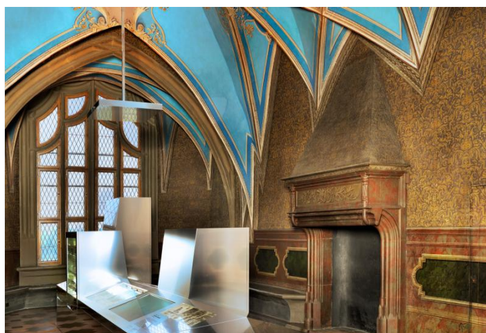
Trendsetter since 1471