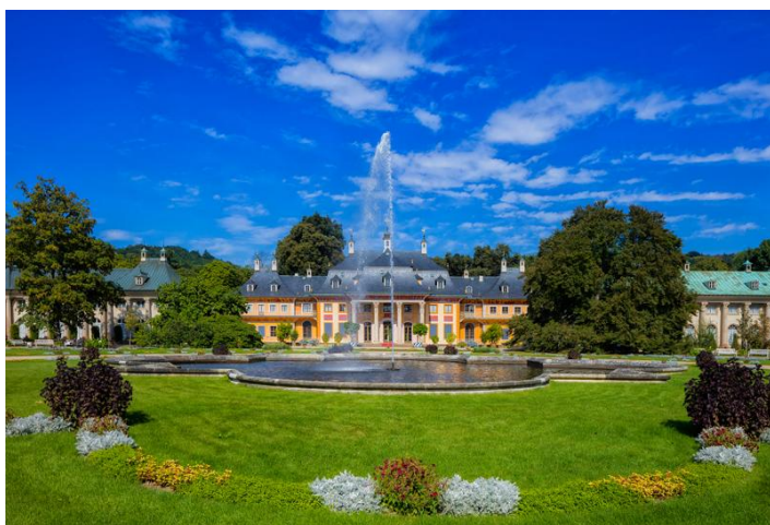
Pillnitz Castle & Park

OFFER can be booked all year round. Duration approx. 1.5 hrs. Admission and guided tour EUR 18.00 p.p. for groups of at least 20. Booking required. Tour guides free of charge. Touristic infrastructure: Parking area for tour buses at the entrance to »Old Guard House« Visitor Center (Besucherzentrum »Alte Wache«). Restaurant at the Dresden-Pillnitz Castle Hotel. Further themed guided tours of the castle and park on enquiry. Full accessibility for people with disabilities can be arranged upon request.