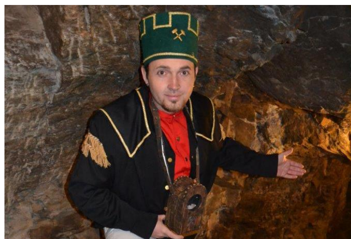
The Magic of Advent at Scharfenstein A.D. 1900 – »Miner's Lamp Tour«