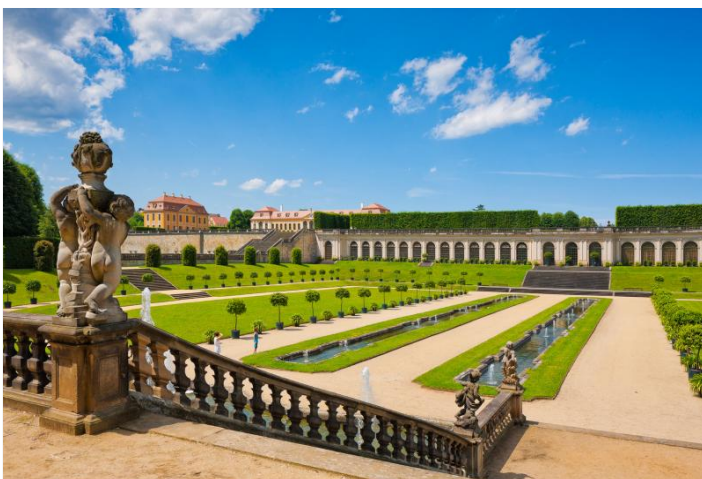
Grosssedlitz Baroque Garden

OFFER can be booked from April to October, one-hour guided tour with tasting EUR 9.00 p.p. (however, at least EUR 70.00). Group size limited to 35 people. Booking required. Tour guides and tour bus drivers free of charge. Further offers on enquiry. Touristic infrastructure: Free tour bus parking immediately in front of the park. Catering: Café am Friedrichsschloesschen. Limited accessibility for people with disabilities. Overnight stays at the Reichskrone Hotel (62 rooms, www.hotel-reichskrone.de )