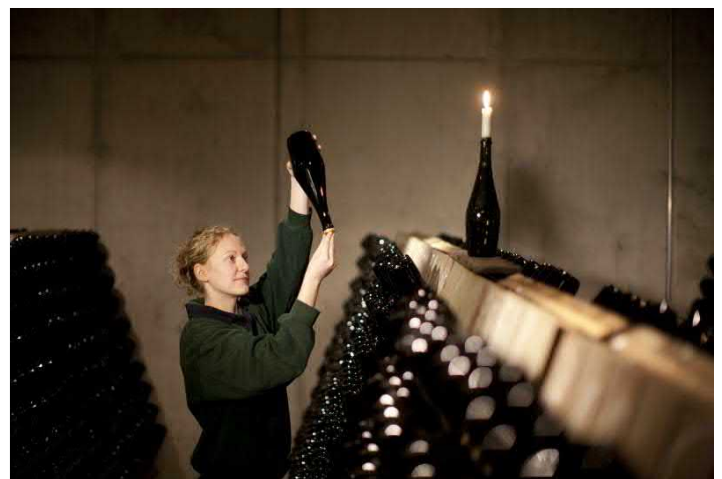
Wackerbarth Castle masterfully maintains the traditional art of bottle fermentation