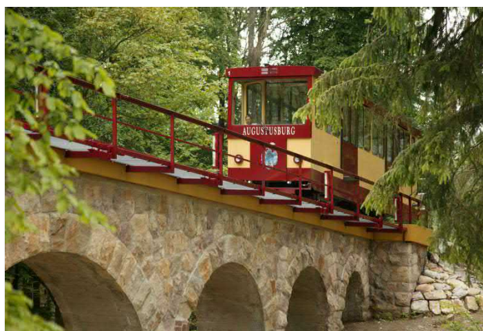
The »Old Lady« cable car