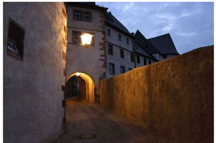
Entrance gate to the castle at dusk