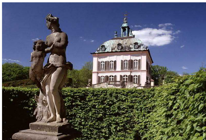
Little Pheasant Castle