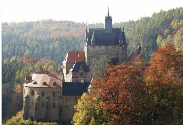
Kriebstein Castle in Fall

GUIDED TOUR can be booked from February to November. Duration approx. 1.5 hrs. Guided castle tour EUR 15.00 p.p. for groups of 15 and more. Booking required. Guided tours outside regular opening hours available on request. Tour guides and tour bus drivers free of charge. The castle inn »Zum Hungerturm« (The Dungeon) can be booked for catering (40 seats, www.burg-kriebstein.de/gaesteservice/gastronomie ). Limited accessibility for people with disabilities. Large parking facility for buses at the Kriebstein dam; turning loop for buses for disembarking/embarking above Kriebstein Castle Hill, ten-minute walk.