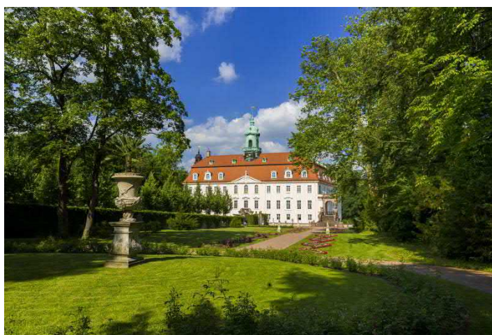
Lichtenwalde Castle & Park

OFFER can be booked from April to October (except on Mondays). Admission rate from EUR 27.00 p.p. for groups of 20 and more; duration approx. 5 hrs. Booking required. Tour guides and tour bus drivers free of charge. From November to March, the castle tour only can be booked alternatively. Touristic infrastructure: Catering directly at the castle (»Vitzthum«, www.restaurant-vitzthum.de ). Overnight stays at the Best Western Hotel at the Castle Park ( www.hotel-lichtenwalde.de ).