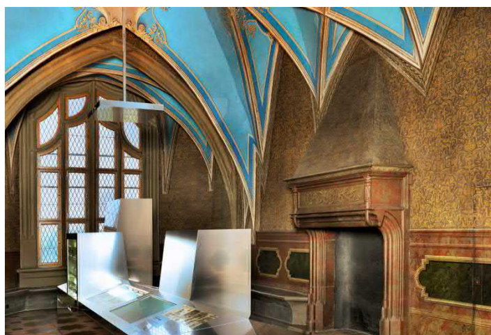
Trendsetter since 1471