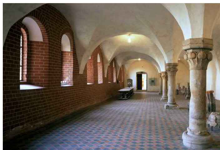
The Converses' Refectory