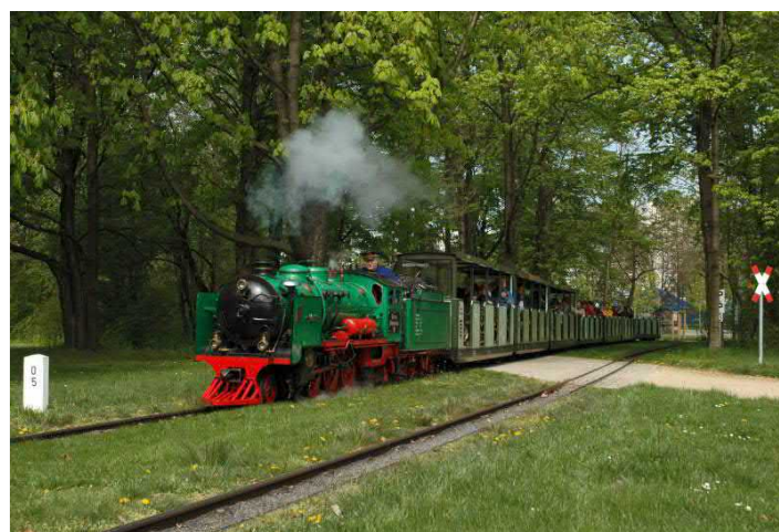
The Park Railway in the Grand Garden