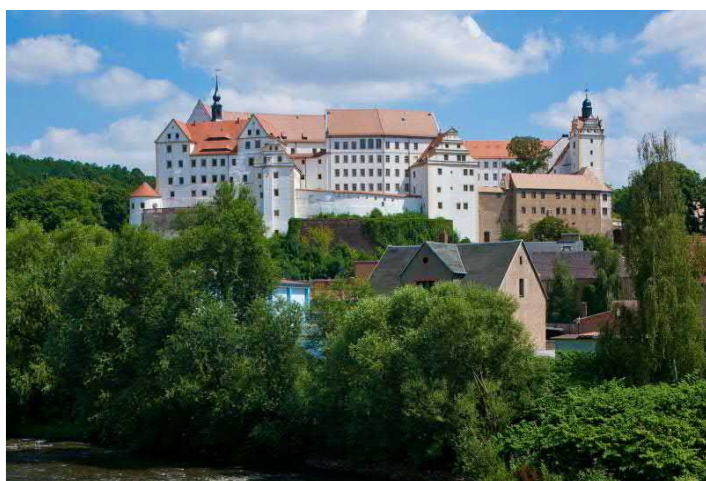
Colditz Castle with European Youth Hostel

OFFER can be booked all year round. Arrival any day of the year (at Christmas on enquiry). Package price EUR 96.00 p.p. in a multi-bed room; EUR 106.00 p.p. in a double room; EUR 116.00 p.p. in a single room. Minimum number of participants: 10. Surcharge for full board (lunch or lunch box) EUR 5.00 p.p. Tour guides and tour bus drivers free of charge. Touristic infrastructure: Free Access and rooms meeting the requirements of persons with disabilities, elevator, tour bus parking directly at the castle. More offers by Colditz Castle at www.schloss-colditz.com