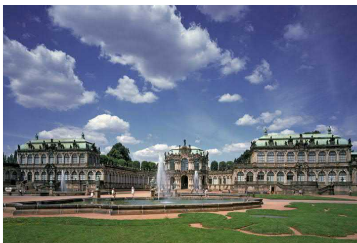
Inner yard of the Zwinger

GUIDED TOUR can be booked from May to September, duration approx. 60 minutes, EUR 8.00 p.p. for groups of 15 or more, plus guided tour rate of EUR 30.00 flat, for groups between 15 and 25 people. Free admission for tour guides and bus drivers. Touristic infrastructure: Bus parking at the Zwinger Pond, catering at the ALTE MEISTER café and restaurant ( www.altemeister.net ).