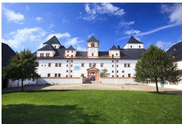
Augustusburg Castle to the south

OFFER can be booked all year round and daily (except when the property is closed), rates from EUR 29.00 p.p., duration approx. 5 hrs., group size from 20 people. Booking required. Admission free of charge for tour guides and bus drivers. Touristic infrastructure: Two bus parking bays directly at the castle. Catering ( www.schlossgaststaette-augustusburg.de ) and accommodation (Youth Hostel Augustusburg Castle: www.jh-augustusburg.de ) available directly on the castle premises.