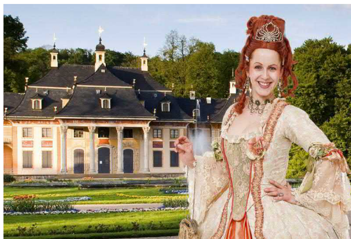
Tour guided by costumed actress