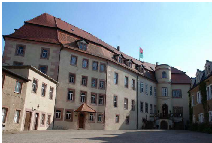
Wolkenburg Castle's inner bailey

GUIDED TOURS can be booked from April to October, 2:00 to 5:00 p.m. and on request, duration approx. 2 hrs., admission fee incl. guided tour and tasting EUR 12.00 p.p., group size 15 to 30 people. Larger traveling parties need to be divided up. Booking required. Tour guides and tour bus drivers free of charge. Touristic infrastructure: Bus parking directly at the castle Tour buses can stop at the foot of the castle hill, parking facilities 150 m from the castle, castle park, catering facilities. Not suited for wheelchair users or people of limited mobility.