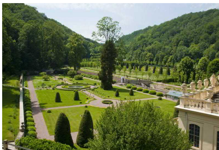
The castle park of Weesenstein