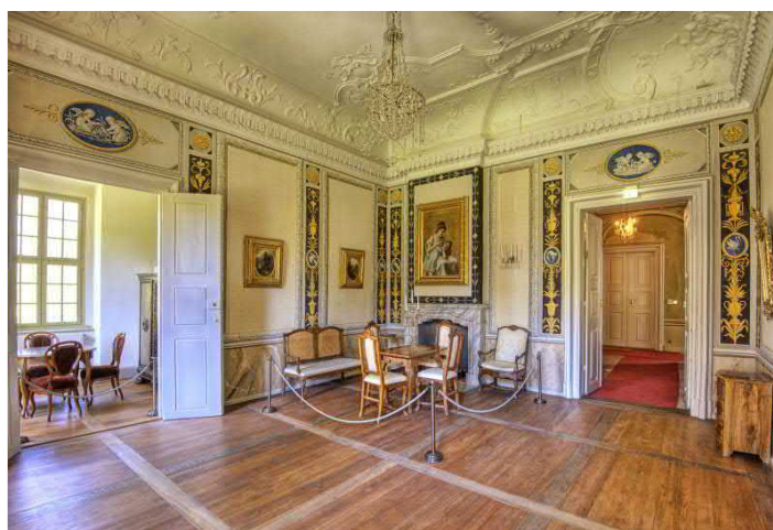
The Golden Room