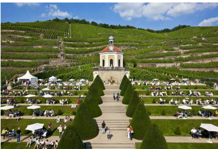
The Belvedere at Wackerbarth Castle

OFFER can be booked all year round. Wine or sparkling wine tour with 3 tastings EUR 12.00 p.p. for groups of 15 or more people. Tour guides and tour bus drivers free of charge. Can optionally be combined with seasonal lunch, dinner or afternoon tea. Further offers on request. Touristic infrastructure: Tour bus parking immediately in front of the winery. Sufficient bus parking available. Fully accessible for people with disabilities.