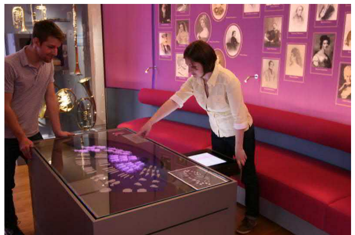
Interactive exhibition at the Graupa Hunting Lodge