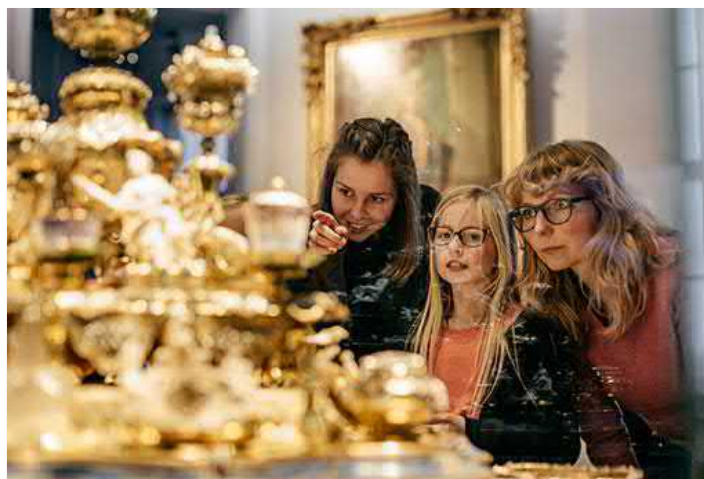
View into the New Green Vault, Photo by David Pinzer, © SKD