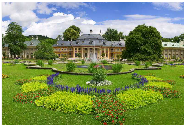
Pillnitz Castle & Park

OFFER can be booked all year round. Duration approx. 1.5 hrs. Admission and guided tour EUR 18.00 p.p. for groups of at least 20. Booking required. Tour guides free of charge. Touristic infrastructure: Parking area for tour buses at the parking lot "Lohmener Strasse". Restaurant at the Dresden-Pillnitz Castle Hotel. Further themed guided tours of the castle and park on enquiry. Full accessibility for people with disabilities can be arranged upon request.