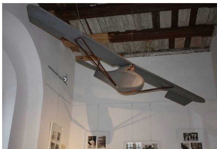
Glider at the Colditz Castle exhibition