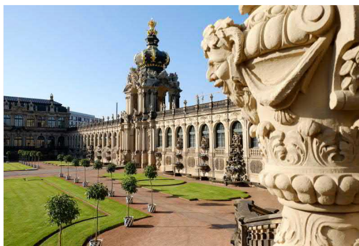
View to the Crown Gate