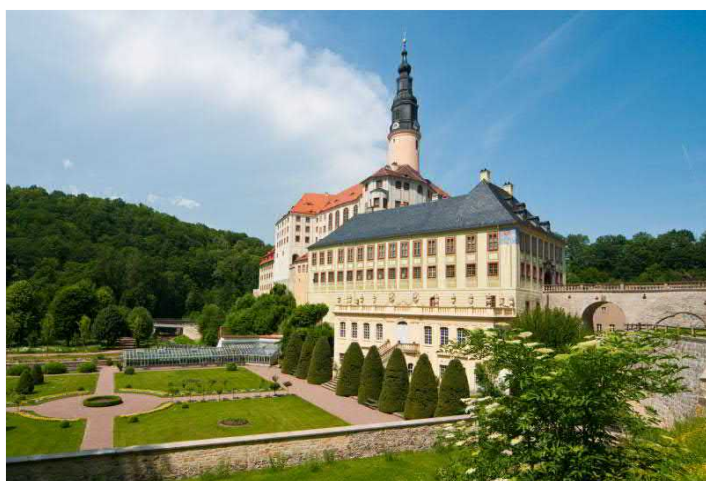
Weesenstein Castle with its castle park

OFFER can be booked all year round. Rate EUR 15.00 p.p., duration approx. 2 hrs., minimum group size 17 people, max. 30. Tour guides and tour bus drivers free of charge (food not included). Further offers on enquiry. Touristic infrastructure: Tour buses can stop at the foot of the castle hill, parking facilities 150 m from the castle, castle park, catering facilities. Limited accessibility for people with disabilities.