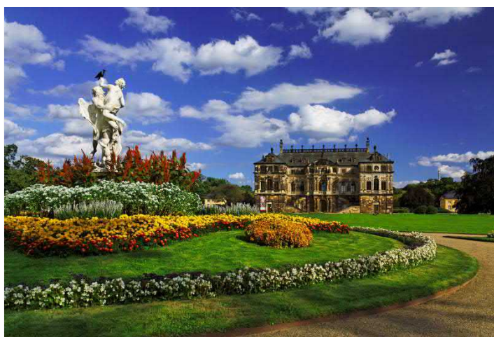
Palace in the Grand Garden

GUIDED TOUR, incl. railway ticket and admission to the Palace EUR 9.00 p.p., children up to age 15 EUR 4.50 p.p., plus guided tour rate of EUR 30.00 for groups of max. 30. Duration approx. 2 hrs. Railway season: Palm Sunday - mid-October (end of Saxon School fall break). Booking requested. Tour guides free of charge. Further offers on request. Access not entirely barrier-free. Overnight stays in the vicinity at www.dresden.de/de/tourismus/buchen/uebernachtung.php