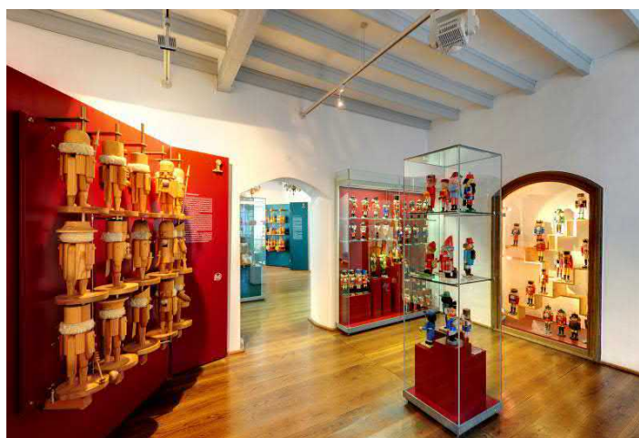
Christmas and Toy Museum