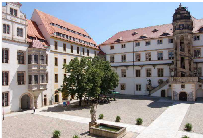
Castle courtyard with the large spiral staircase

GUIDED TOUR can be booked all year round (Tues to Thurs if available), one hour: EUR 70.00 per group up to 25 people; two hours: EUR 100.00 per group up to 25 people, plus combined ticket (both exhibitions) at the special group rate of EUR 5.00 p.p.; guided tour of Torgau one hour: EUR 60.00 per group up to 25 people; two hours: EUR 90.00 per group up to 25 people, plus admissions (various visits inside can be booked). Touristic infrastructure: Various possibilities of catering in Torgau ( www.tic.torgau.de/download/Service/Gastrofuehrer.pdf ).