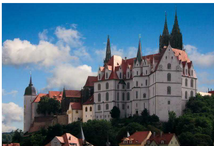
The Meissen Castle hill with Cathedral and Albrechtsburg

ADMISSION, VISIT and GUIDED TOUR of Meissen Albrechtsburg Castle and HOUSE OF MEISSEN® World of Experience at the group rate (from 20 people) of EUR 22.00 p.p., including a one-hour guided walk through Meissen city center to the respectively other property (guided walk or by tour bus). The guided tour may start at Meissen Albrechtsburg Castle or HOUSE OF MEISSEN® World of Experience. Guided tours in foreign languages on request. Touristic infrastructure: Freely accessible for people with disabilities; tour bus parking facilities available.