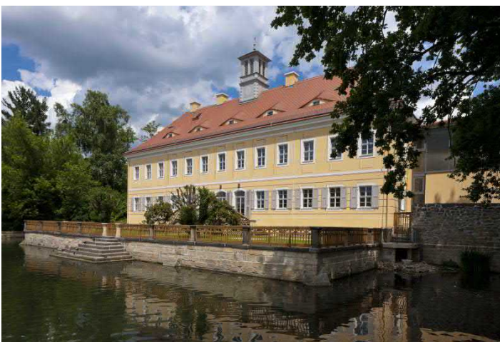
Graupa Hunting Lodge

OFFER can be booked all year round, duration approx. 2 hrs., admission rate incl. guided tour and sparkling wine, tour guide and titbit EUR 15.00 for groups from ten people, EUR 17.00 p.p. for groups up to ten. Plus EUR 40.00 flat per group for the guided tour. Can be supplemented on advance request by exclusive concerts or having teatime. Booking required. Free admission for bus drivers and tour guides. Touristic infrastructure: Buses are allowed to stop for disembarking and embarking only a few meters away; free bus parking about 100 m from the Richard-Wagner-Staetten Graupa. Limited accessibility for people with disabilities.