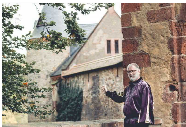
With the masterbuilder on tour