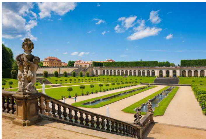
Grosssedlitz Baroque Garden

OFFER can be booked from May to September, one-hour guided tour with tasting EUR 9.00 p.p. (however, at least EUR 70.00). Group size limited to 35 people. Booking required. Tour guides and tour bus drivers free of charge. Further offers on enquiry. Touristic infrastructure: Free tour bus parking immediately in front of the park. Catering: Café am Friedrichsschloessen. Limited accessibility for people with disabilities. Overnight stays at the Reichskrone Hotel (62 rooms, www.hotel-reichskrone.de )