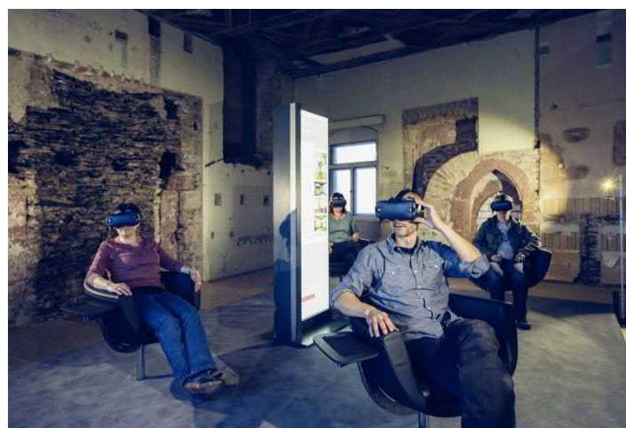
Explore bygone times through VR glasses