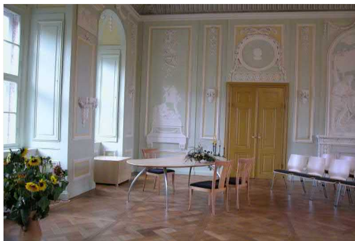
Ceremonial hall at Wolkenburg Castle