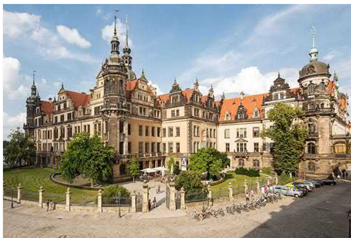
The Dresden Royal Palace, Photo by David Brandt, 2013, © SKD

GUIDED TOUR can be booked all year round (except on Tuesdays). Admission for groups of ten or more EUR 11.00 p.p., plus guided tour rate of EUR 90.00 flat. Duration approx. 1.5 hrs., for groups of up to 25 people. Tour guide free of charge. Booking required. Further services on enquiry. Touristic infrastructure: Barrier-free access, except the Hausmannsturm tower. Overnight stays in the vicinity at www.dresden.de/de/tourismus/buchen/uebernachtung.php