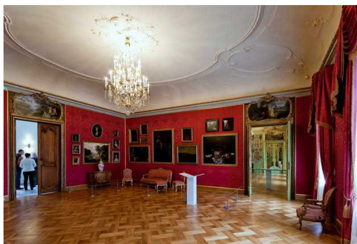
The Red Salon