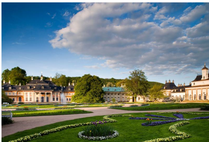
Pillnitz Castle and Park

OFFER can be booked all year round. Duration: approx. 1.5 hrs. Admission and guided tour EUR 18.00 p.p. for groups of at least 20. Booking required. Tour guides free of charge. Touristic infrastructure: Barrier-free access can be arranged upon request. Parking area for tour buses at the entrance to »Old Guard House« Visitor Center (Besucherzentrum »Alt Wache«). Restaurant at the Dresden-Pillnitz Castle Hotel. Further themed guided tours of the castle and park on enquiry.