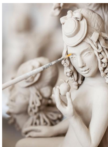
HOUSE OF MEISSEN® - A World of Experience