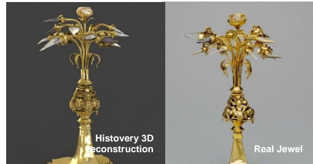
Making-of : 3D reconstruction (left) of a 1450 « Natternzungen-Kredenz » exhibited in the Kunsthistorisches Museum (right)

The best cultural outreach, available to 100% of visitors: a first in Germany