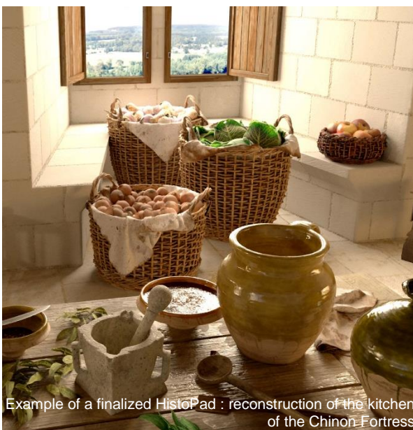
Example of a finalized HistoPad : reconstruction of the kitchen of the Chinon Fortress

Young visitors and their parents will take part in a treasure hunt , send themselves a historic selfie or even use the interactive map to find useful information about their visit and way around the castle. Any visit is made a delightful shared experience of amusement and discovery.