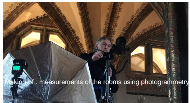
Making-of : measurements of the rooms using photogrammetry

The HistoPad is developed jointly by Schlösserland Sachsen and Histovery. Since 2013, Histovery has developed the Augmented Visit in 15 museums and monuments, reaching over 2 million visitors per year. Among its cultural partners are the Castle of Chambord, the Popes' Palace in Avignon and the Conciergerie in Paris. With the Albrechtsburg HistoPad, it is the first time that the French Tech start up brings its expertise abroad.