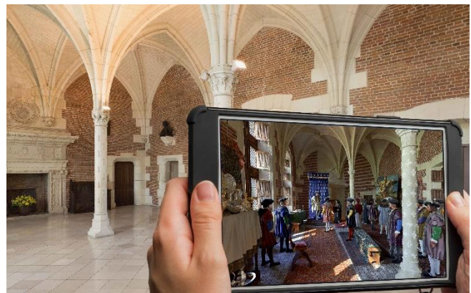
Example of a finalized HistoPad : reconstruction of the 1518 Great Hall in the Amboise Castle

Enabled by meticulous historical research, the faithfulness of the reconstructions has been confirmed by a committee of renowned experts from Staatliche Schlösser, Burgen und Gärten Sachsen specialized in the late Middle Ages and in the former manufacture of porcelain of Saxony.