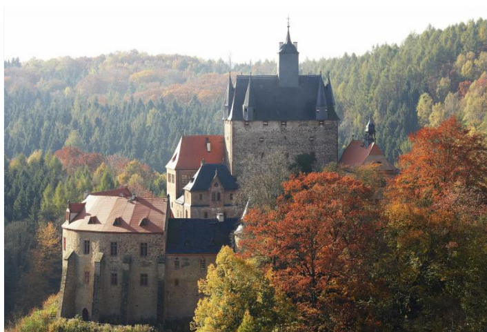
Kriebstein Castle in Fall

GUIDED TOUR can be booked from February to November. Duration approx. 1.5 hrs. Guided castle tour EUR 15.00 p.p. for groups of 15 and more. Booking required. Guided tours outside regular opening hours available on request. Tour guides and tour bus drivers free of charge. The castle inn »Zum Hungerturm« (The Dungeon) can be booked for catering (40 seats, www.burg-kriebstein.de/gaesteservice/gastronomie ). Limited accessibility for people with disabilities. Large parking facility for buses at the Kriebstein dam; turning loop for buses for disembarking/embarking above Kriebstein Castle Hill, ten-minute walk.