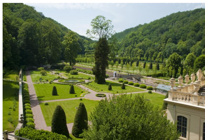
The castle park of Weesenstein