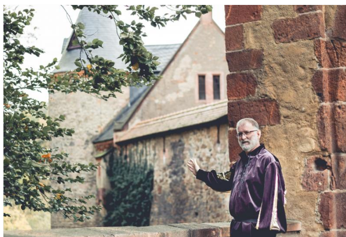
With the masterbuilder on tour