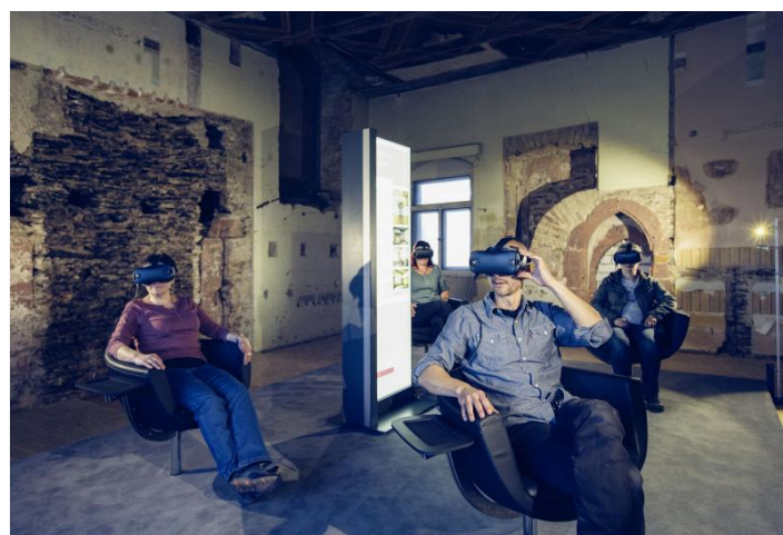
Explore bygone times through VR glasses