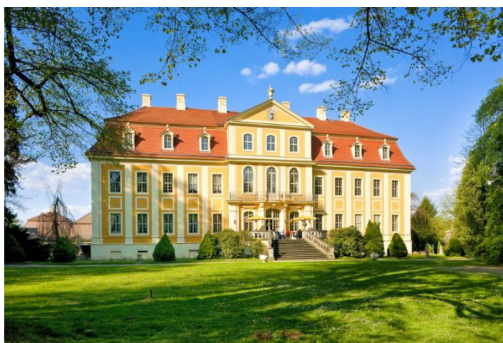
Rammenau Baroque Castle

OFFER can be booked all year round. Duration of the guided tour approx. 45 mins. Admission and guided tour EUR 9.00 p.p. for groups of 16 people or more. Booking required. Tour guides and tour bus drivers free of charge. Touristic infrastructure: Tour buses can stop for embarking and disembarking immediately at the gate to the castle grounds, tour bus parking facilities free of charge. 50 m to walk to the historical dining rooms at the castle. Limited accessibility for people with disabilities.