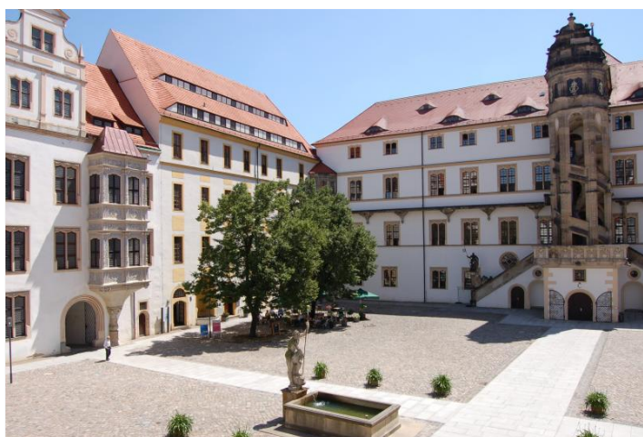
Castle courtyard with the large spiral staircase

GUIDED TOUR can be booked all year round (Tues to Thurs if available), one hour: EUR 70.00 per group up to 25 people; two hours: EUR 100.00 per group up to 25 people, plus combined ticket (both exhibitions) at the special group rate of EUR 5.00 p.p.; guided tour of Torgau one hour: EUR 60.00 per group up to 25 people; two hours: EUR 90.00 per group up to 25 people, plus admissions (various visits inside can be booked). Touristic infrastructure: Various possibilities of catering in Torgau ( www.tic.torgau.de/download/Service/Gastrofuehrer.pdf ).