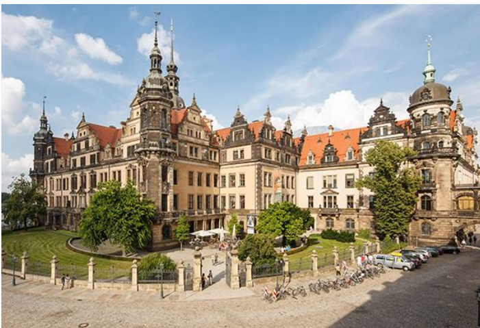
The Dresden Royal Palace, Photo by David Brandt, 2013, © SKD

GUIDED TOUR can be booked all year round (except on Tuesdays). Admission for groups of ten or more EUR 11.00 p.p., plus guided tour rate of EUR 90.00 flat. Duration approx. 1.5 hrs., for groups of up to 25 people. Tour guide free of charge. Booking required. Further services on enquiry. Touristic infrastructure: Barrier-free access, except the Hausmannsturm tower. Overnight stays in the vicinity at www.dresden.de/de/tourismus/buchen/uebernachtung.php