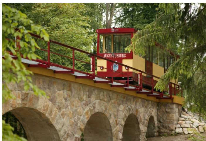
The »Old Lady« cable car