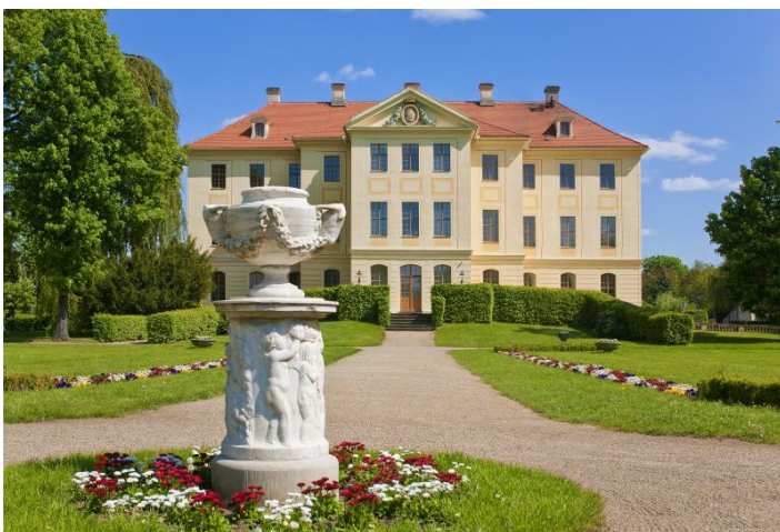
Zabeltitz Baroque Garden

OFFER can be book all year round. For groups between 10 and 40 people, all-in offer EUR 13.00 p.p. Booking required. Admission and guided tour free of charge for tour guides and tour bus drivers. Further offers on enquiry. Touristic infrastructure: Free tour bus parking immediately next to the park. Limited accessibility for people with disabilities. Overnight stays at Parkschaenke Zabeltitz (three-star rating, 13 double rooms, 1 single room, www.parkschaenke-zabeltitz.de )