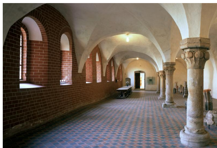
The Converses' Refectorium