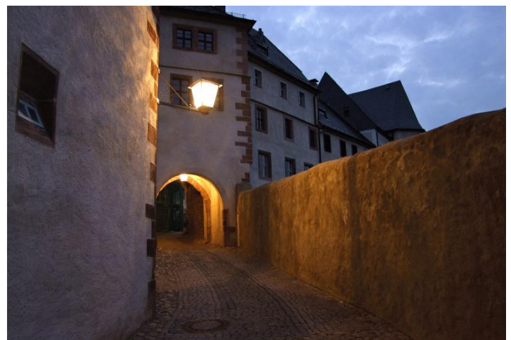
Entrance gate to the castle at dusk