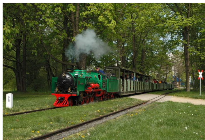
The Park Railway in the Grand Garden