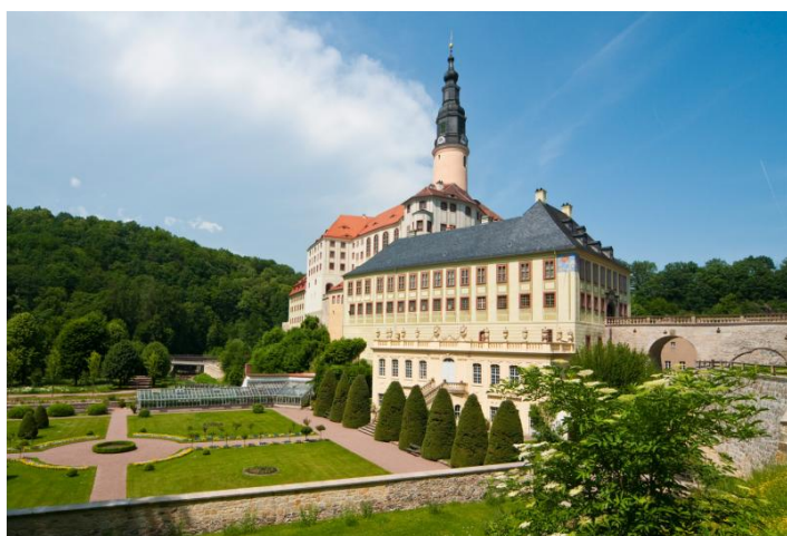
Weesenstein Castle with its castle park

OFFER can be booked all year round. Rate EUR 15.00 p.p., duration approx. 2 hrs., minimum group size 17 people, max. 30. Tour guides and tour bus drivers free of charge (food not included). Further offers on enquiry. Touristic infrastructure: Tour buses can stop at the foot of the castle hill, parking facilities 150 m from the castle, castle park, catering facilities. Limited accessibility for people with disabilities.