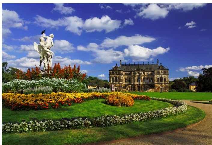
Palace in the Grand Garden

GUIDED TOUR, incl. railway ticket and admission to the Palace EUR 9.00 p.p., children up to age 15 EUR 4.50 p.p., plus guided tour rate of EUR 30.00 for groups of max. 30. Duration approx. 2 hrs. Railway season: Palm Sunday - mid-October (end of Saxon School fall break). Booking requested. Tour guides free of charge. Further offers on request. Access not entirely barrier-free. Overnight stays in the vicinity at www.dresden.de/de/tourismus/buchen/uebernachtung.php