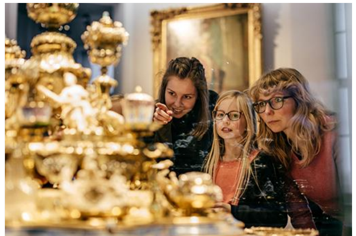
View into the New Green Vault