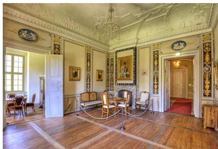
The Golden Room