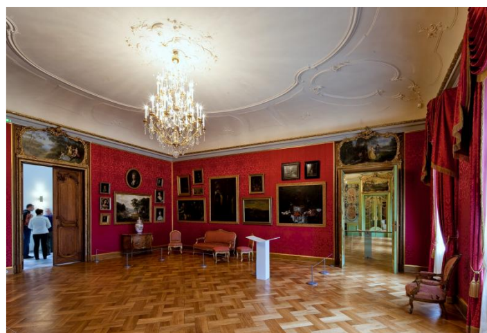
The Red Salon