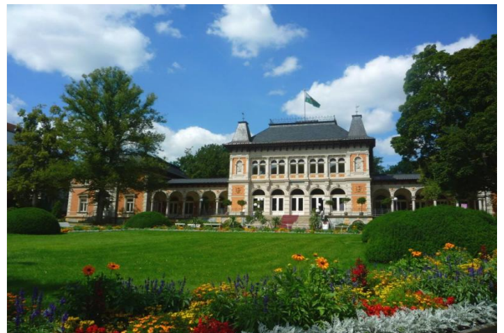
The royal spa house