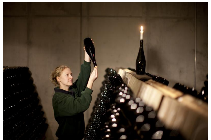
Wackerbarth Castle masterfully maintains the traditional art of bottle fermentation