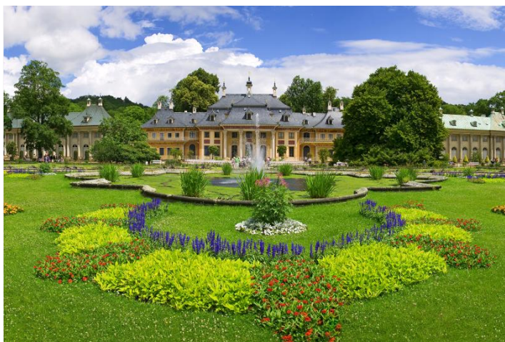
Pillnitz Castle & Park

OFFER can be booked all year round. Duration approx. 1.5 hrs. Admission and guided tour EUR 18.00 p.p. for groups of at least 20. Booking required. Tour guides free of charge. Touristic infrastructure: Parking area for tour buses at the entrance to »Old Guard House« Visitor Center (Besucherzentrum »Alte Wache«). Restaurant at the Dresden-Pillnitz Castle Hotel. Further themed guided tours of the castle and park on enquiry. Full accessibility for people with disabilities can be arranged upon request.