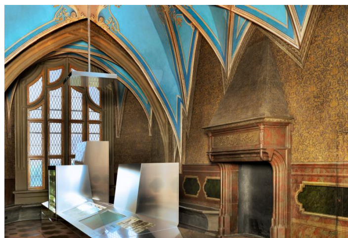
Trendsetter since 1471