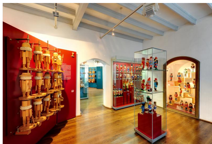
Christmas and Toy Museum