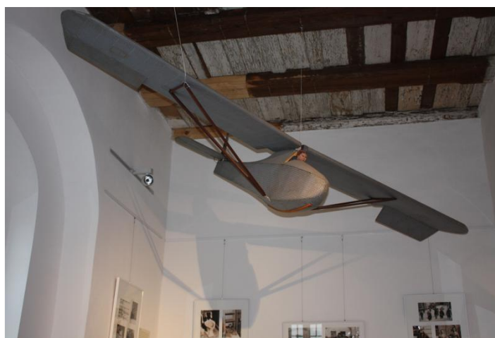
Glider at the Colditz Castle exhibition