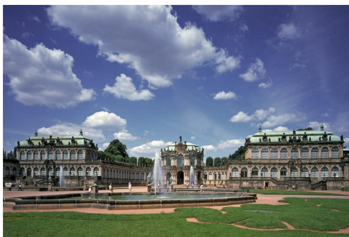
Inner yard of the Zwinger

GUIDED TOUR can be booked from May to September, duration approx. 60 minutes, EUR 8.00 p.p. for groups of 15 or more, plus guided tour rate of EUR 30.00 flat, for groups between 15 and 25 people. Free admission for tour guides and bus drivers. Touristic infrastructure: Bus parking at the Zwinger Pond, catering at the ALTE MEISTER café and restaurant ( www.altemeister.net ).