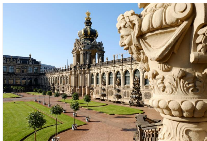
View to the Crown Gate