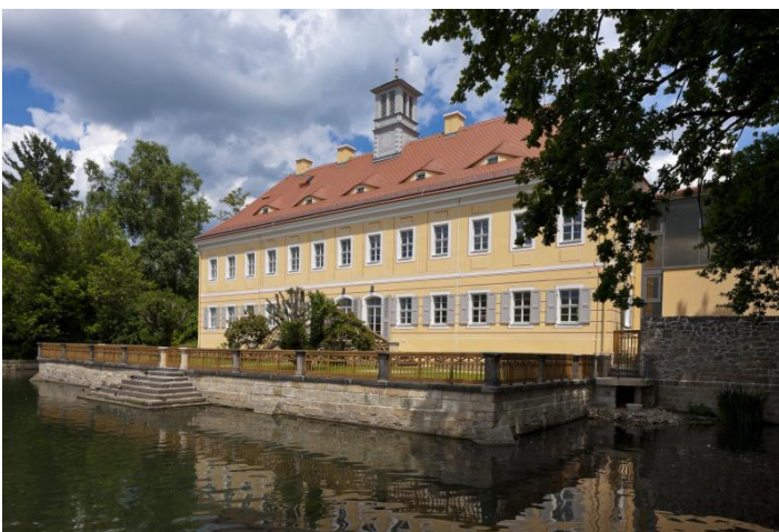
Graupa Hunting Lodge

OFFER can be booked all year round, duration approx. 2 hrs., admission rate incl. guided tour and sparkling wine, tour guide and titbit EUR 15.00 for groups from ten people, EUR 17.00 p.p. for groups up to ten. Plus EUR 40.00 flat per group for the guided tour. Can be supplemented on advance request by exclusive concerts or having teatime. Booking required. Free admission for bus drivers and tour guides. Touristic infrastructure: Buses are allowed to stop for disembarking and embarking only a few meters away; free bus parking about 100 m from the Richard-Wagner-Stätten Graupa. Limited accessibility for people with disabilities.