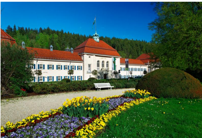
The Albert Spa Bath

GUIDED TOURS can be booked all year round incl. a guided tour of the King Albert Theater (approx. 2.5 hrs.), groups of 15 to 50 people, EUR 95.20, plus admission to the Saxon Spa Museum EUR 3.00 p.p., booking required. Further offers on enquiry. Overnight stays at the King Albert Hotel (four-star rating, www.hotelkoenigalbert.de ), which newly opened in 2016.