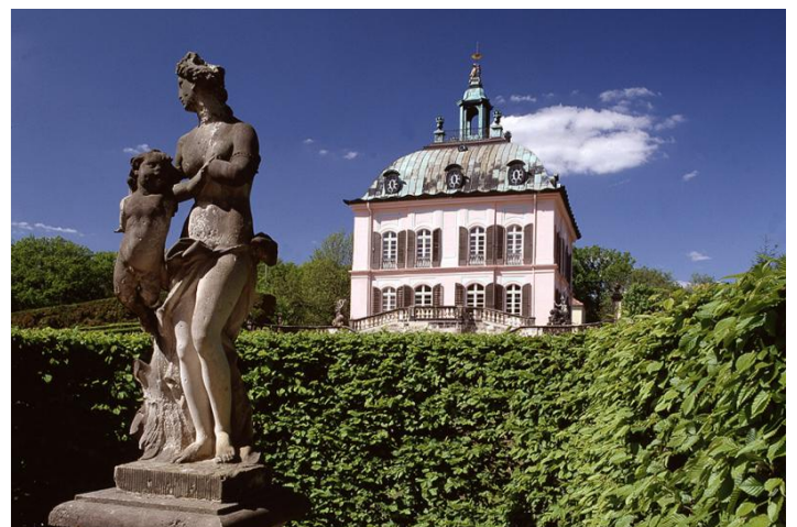
Little Pheasant Castle