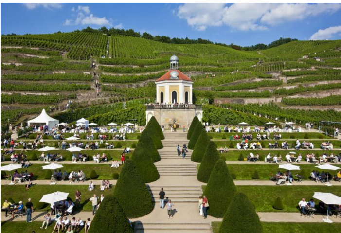
The Belvedere at Wackerbarth Castle

OFFER can be booked all year round. Wine or sparkling wine tour with 3 tastings EUR 12.00 p.p. for groups of 15 or more people. Tour guides and tour bus drivers free of charge. Can optionally be combined with seasonal lunch, dinner or afternoon tea. Further offers on request. Touristic infrastructure: Tour bus parking immediately in front of the winery. Sufficient bus parking available. Fully accessible for people with disabilities.