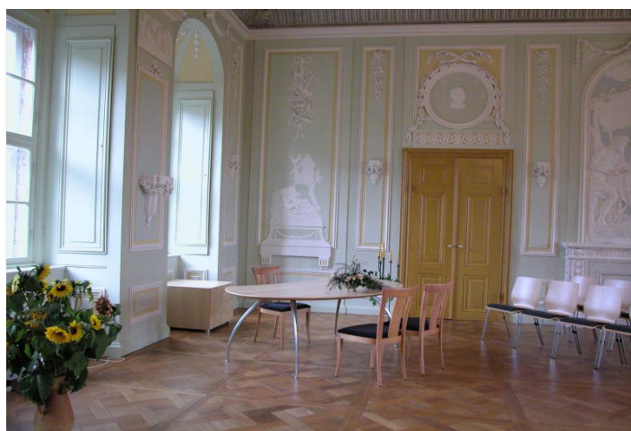
Ceremonial hall at Wolkenburg Castle