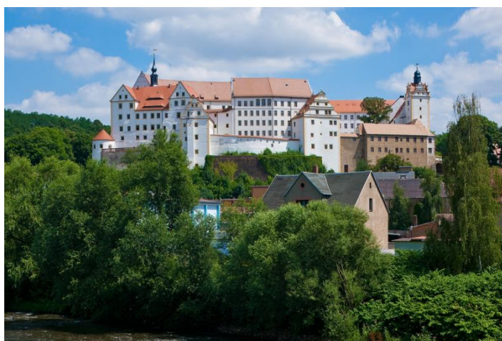
Colditz Castle with European Youth Hostel

OFFER can be booked all year round. Arrival any day of the year (at Christmas on enquiry). Package price EUR 96.00 p.p. in a multi-bed room; EUR 106.00 p.p. in a double room; EUR 116.00 p.p. in a single room. Minimum number of participants: 10. Surcharge for full board (lunch or lunch box) EUR 5.00 p.p. Tour guides and tour bus drivers free of charge. Touristic infrastructure: Free Access and rooms meeting the requirements of persons with disabilities, elevator, tour bus parking directly at the castle. More offers by Colditz Castle at www.schloss-colditz.com