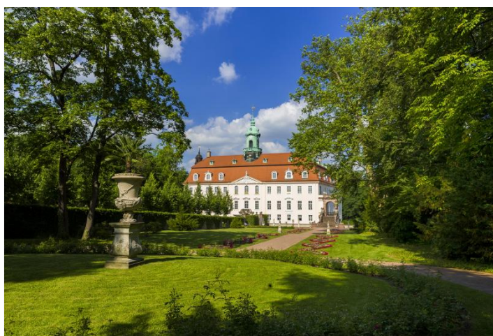
Lichtenwalde Castle & Park

OFFER can be booked from April to October (except on Mondays). Admission rate from EUR 27.00 p.p. for groups of 20 and more; duration approx. 5 hrs. Booking required. Tour guides and tour bus drivers free of charge. From November to March, the castle tour only can be booked alternatively. Touristic infrastructure: Catering directly at the castle (»Vitzthum«, www.restaurant-vitzthum.de ). Overnight stays at the Best Western Hotel at the Castle Park ( www.hotel-lichtenwalde.de ).