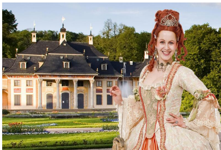
Tour guided by costumed actress