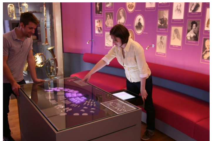
Interactive exhibition at the Graupa Hunting Lodge