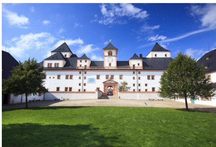
Augustusburg Castle to the south

OFFER can be booked all year round and daily (except when the property is closed), rates from EUR 29.00 p.p., duration approx. 5 hrs., group size from 20 people. Booking required. Admission free of charge for tour guides and bus drivers. Touristic infrastructure: Two bus parking bays directly at the castle. Catering ( www.schlossgaststaette-augustusburg.de ) and accommodation (Youth Hostel Augustusburg Castle: www.jh-augustusburg.de ) available directly on the castle premises.