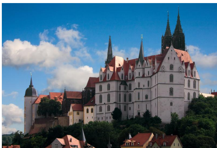
The Meissen Castle hill with Cathedral and Albrechtsburg

ADMISSION, VISIT and GUIDED TOUR of Meissen Albrechtsburg Castle and HOUSE OF MEISSEN® World of Experience at the group rate (from 20 people) of EUR 22.00 p.p., including a one-hour guided walk through Meissen city center to the respectively other property (guided walk or by tour bus). The guided tour may start at Meissen Albrechtsburg Castle or HOUSE OF MEISSEN® World of Experience. Guided tours in foreign languages on request. Touristic infrastructure: Freely accessible for people with disabilities; tour bus parking facilities available.