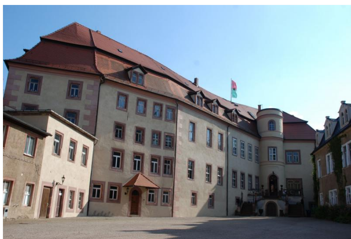
Wolkenburg Castle's inner bailey

GUIDED TOURS can be booked from April to October, 2:00 to 5:00 p.m. and on request, duration approx. 2 hrs., admission fee incl. guided tour and tasting EUR 12.00 p.p., group size 15 to 30 people. Larger traveling parties need to be divided up. Booking required. Tour guides and tour bus drivers free of charge. Touristic infrastructure: Bus parking directly at the castle Tour buses can stop at the foot of the castle hill, parking facilities 150 m from the castle, castle park, catering facilities. Not suited for wheelchair users or people of limited mobility.