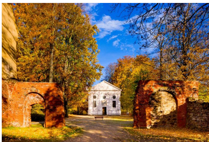
The Mausoleum at Altzella Monastery Park

ADMISSION and GUIDED TOUR can be booked from April to October. Duration approx. 2.5 hrs. Admission rate, guided tour and tasting EUR 20.00 p.p. for groups between 15 to 35. Booking required. Tour guides and tour bus drivers free of charge. Further offers on enquiry. Touristic infrastructure: Parking directly on the monastery premises. Cafeteria in the service area of the monastery park. Limited accessibility for people with disabilities. Overnight stays at the monastery lodge "Froehnerhaus" ( www.kloster-altzella.de/de/klosterherberge ; three singles, three doubles, two multi-bed, max. 25 beds) on the monastery premises.