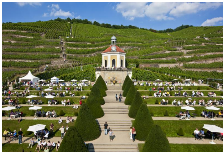
The Belvedere at Wackerbarth Castle

OFFER can be booked all year round. Wine or sparkling wine tour with 3 tastings EUR 12.00 p.p. for groups of 15 or more people. Tour guides and tour bus drivers free of charge. Can optionally be combined with seasonal lunch, dinner or afternoon tea. Further offers on request. Touristic infrastructure: Tour bus parking immediately in front of the winery. Sufficient bus parking available. Fully accessible for people with disabilities.