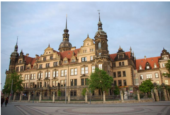
Residential Castle

GUIDED TOUR can be booked all year round (except on Tuesdays). Duration approx. 1,5 hr. Admission EUR 11.00 p.p., plus guided tour rate of EUR 90.00. For groups of up to 25 people. Tour guide free of charge. Booking required. Further services on enquiry. Touristic infrastructure: Barrier-free access, except the Hausmannsturm tower. Overnight stays via www.dresden.de/de/tourismus/buchen/uebernachtung.php .