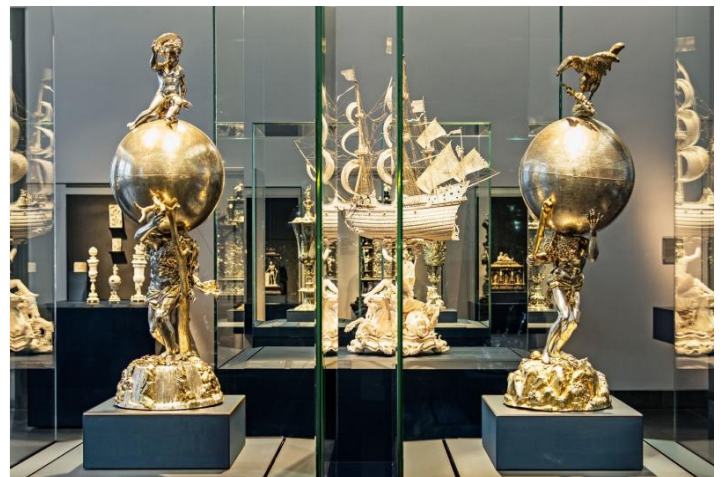
New Green Vault, photo: H. C. Krass, © SKD