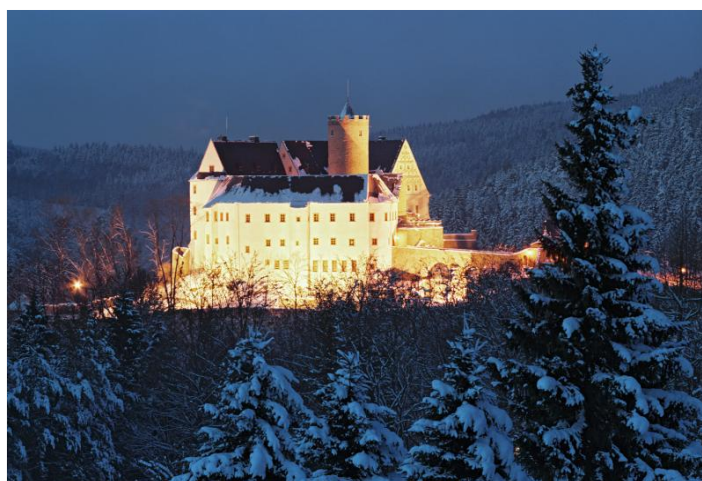
Wintry Scharfenstein Castle at Night