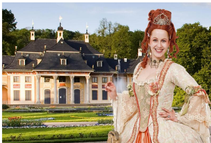
Guided Tour with Costumed Actress