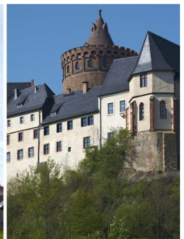
The Castle Chapel from the East