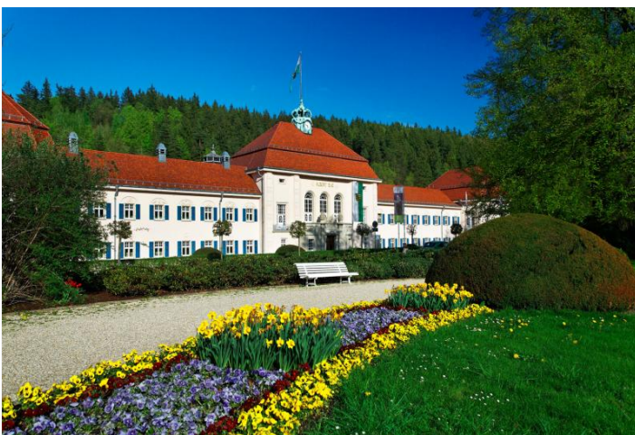
The Albert Spa Bath

OFFER can be booked all year round. Historical guided tour of the town: duration approx. 2.5 hrs, for groups of 15 to 50 people, EUR 95.20, plus entrance to the Saxon Spa Museum EUR 3.00 p.p. Booking required. Further offers on enquiry. Tour guides and tour bus drivers free of charge. Touristic infrastructure: tour bus parking facilities at the start of the town. Access not entirely barrier-free. Overnight stays at the Koenig Albert Hotel (four-star rating, www.hotelkoenigalbert.de )