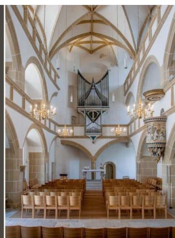
Protestant Castle Church