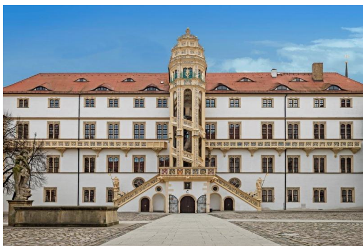
Hartenfels Castle - »Großer Wendelstein« and »Langer Gang«

Guided tour of Torgau (2 hrs.): EUR 75.00 per group plus admission fee of EUR 2.00 p.p.