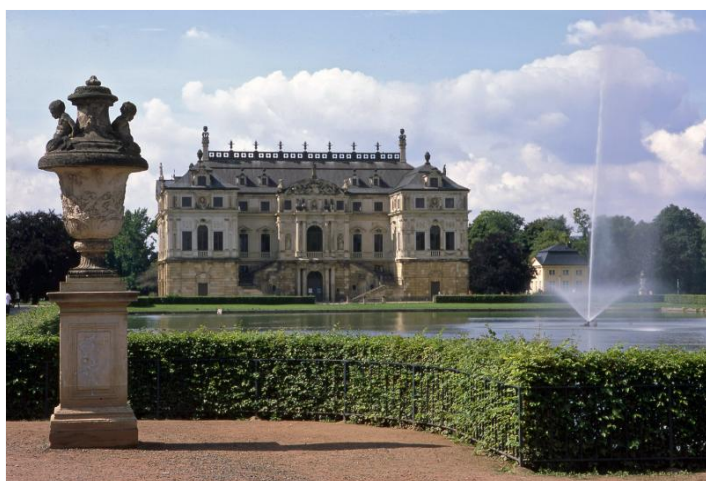
Ornamental Square and Palace at the Grand Garden of Dresden

GUIDED TOUR, incl. railway ticket and admission to the Palace EUR 9.00 p.p., children up to age 15 EUR 4.50 p.p., plus guided tour rate of EUR 30.00 for groups of max. 30. Duration: approx. 2 hrs. Railway season: Maundy Thursday - October. Booking requested. Tour guides free of charge. Railway rides outside the regular timetable are possible at special rates. Further offers on request. Access not entirely barrier-free. Overnight stay via www.dresden.de/de/tourismus/buchen/uebernachtung.php