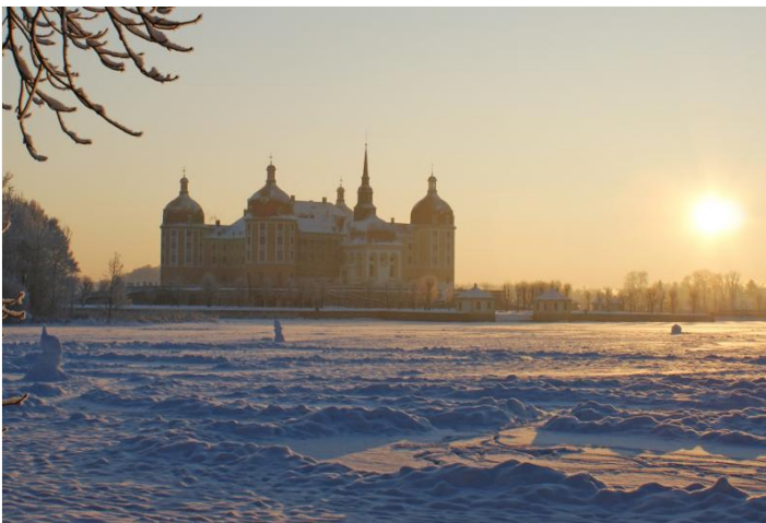
Royal & Fabulous: The Baroque Moritzburg Castle

DIRECTIONS by bus/car: A4 exit Dresden-Wilder Mann | A13 exit Radeburg (follow the signage to the large car park; only 250m to walk up to the castle)