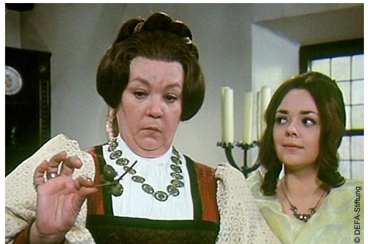
Film scene from Three Hazelnuts for Cinderella