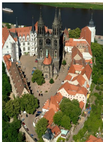
Aerial View of the Castle Hill