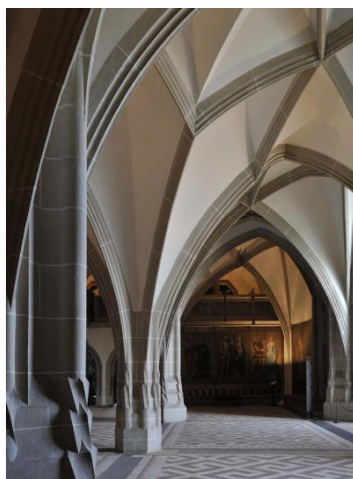
Grand Hall

OFFER can be booked all year round. Ticket incl. guided tour EUR 9.50 p.p. For groups of 15 and more people. Duration approx. 1 hr. Booking required. Groups may be divided according to their size. Touristic infrastructure: Tour bus parking facilities available, possible access to the castle hill by elevator. Overnight stays via Meißen Tourist-Info ( www.touristinfo-meissen.de )