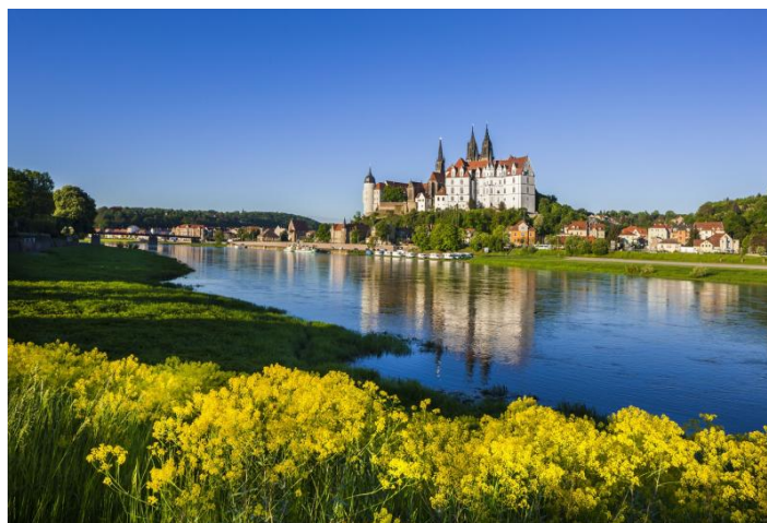
Meissen Albrechtsburg Castle