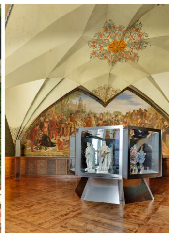
Trendsetter since 1471