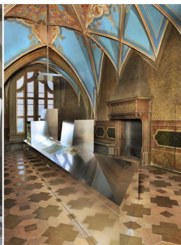
Trendsetter since 1471