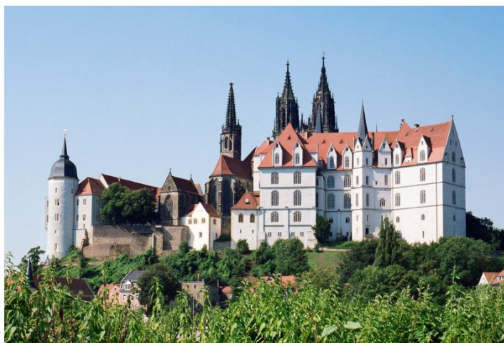
Castle Hill with Cathedral and Albrechtsburg Castle

GUIDED TOUR can be booked from April to October 2016, Mondays to Saturdays. Combined tickets for the guided tour EUR 12.00 p.p., concession rate EUR 8.00 p.p., beginning at 11:30 am. Duration: approx. 1.5 hrs. Booking required. Optional: guided tour »God's Fortress & Princely Splendor« (excluding the »Sound« part) EUR 10.50 p.p., concession rate EUR 6.50 p.p., can be booked all year round, not fixed to beginning times. Touristic infrastructure: Tour bus parking facilities available, possible access to the castle hill by elevator. Overnight stays via Meißen Tourist-Info ( www.touristinfo-meissen.de )